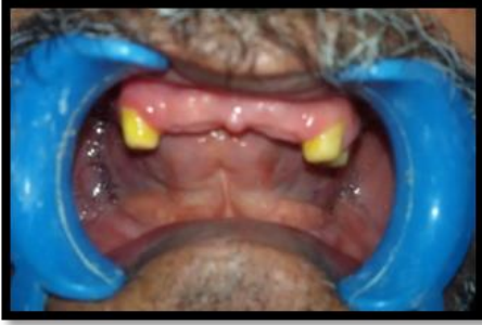
After tooth preparation