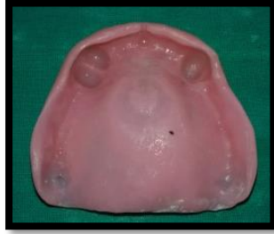
Maxillary denture showing the tissue surface