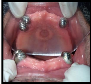
Copings on cast Copings in mouth