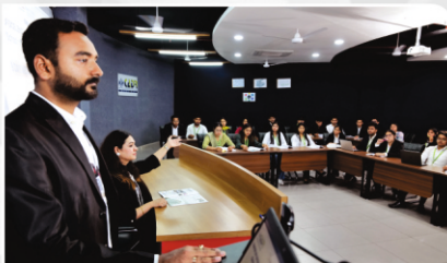
Centre of Excellence on Alternative Dispute Resolution