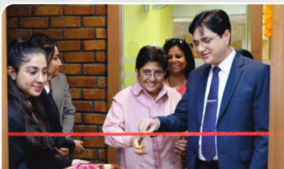
Centre for Public Policy, Law and Governance