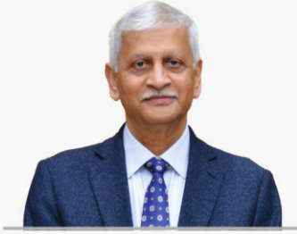
Hon'ble Justice U.U. Lalit Former Chief Justice of India