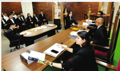
Legal Aid Clinic & Moot Court