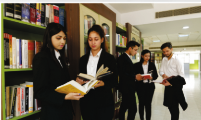
Shri Ratan Lal Lahoti Memorial Law Library