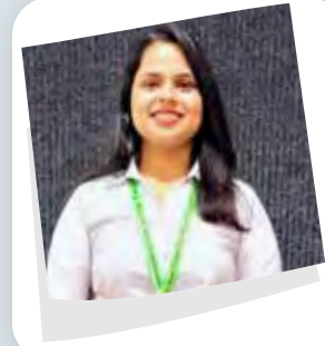
Muskan Nagar FMS, MRIIRS