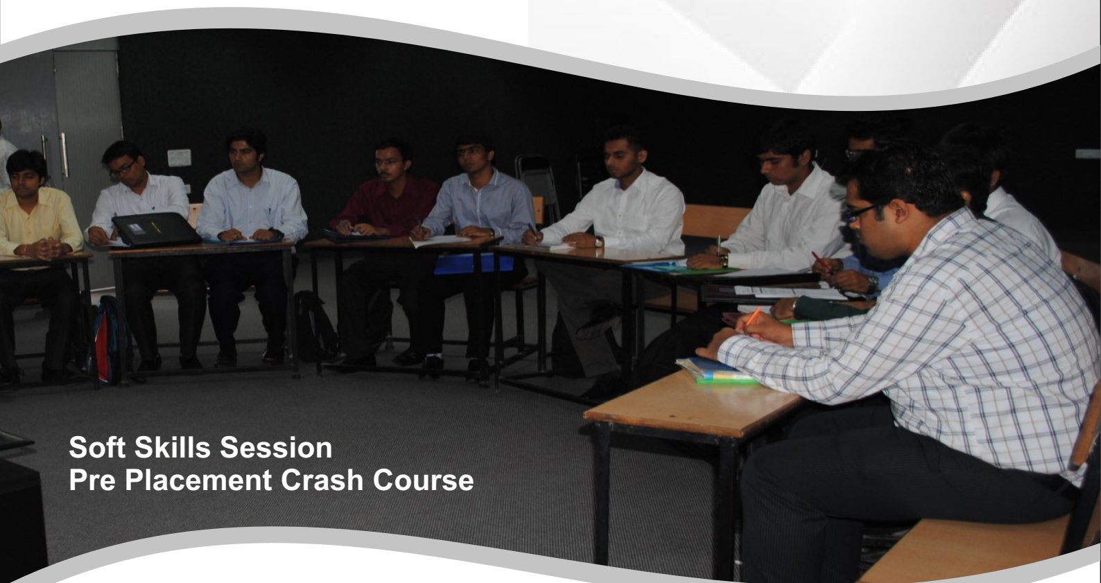
Soft Skills Session Pre Placement Crash Course