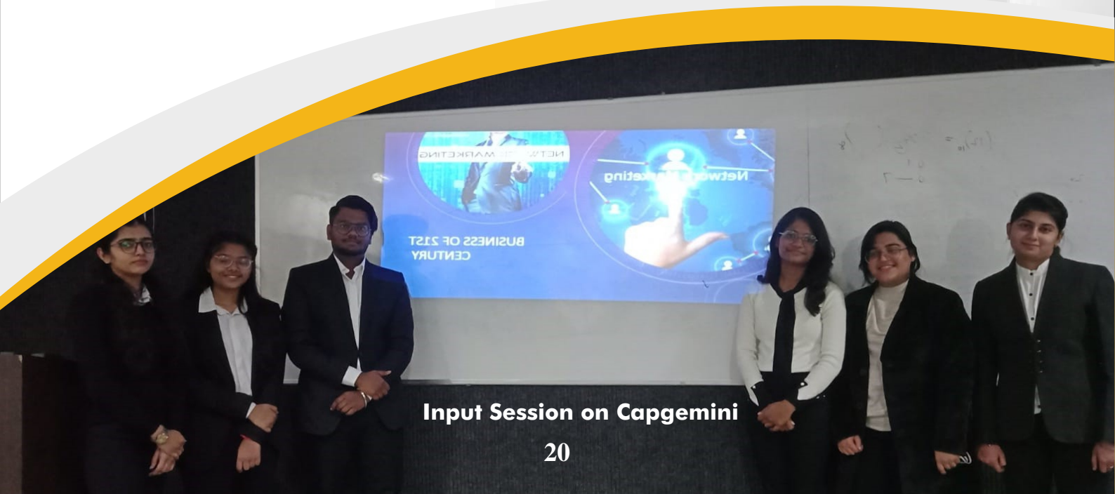
Input Session on Capgemini