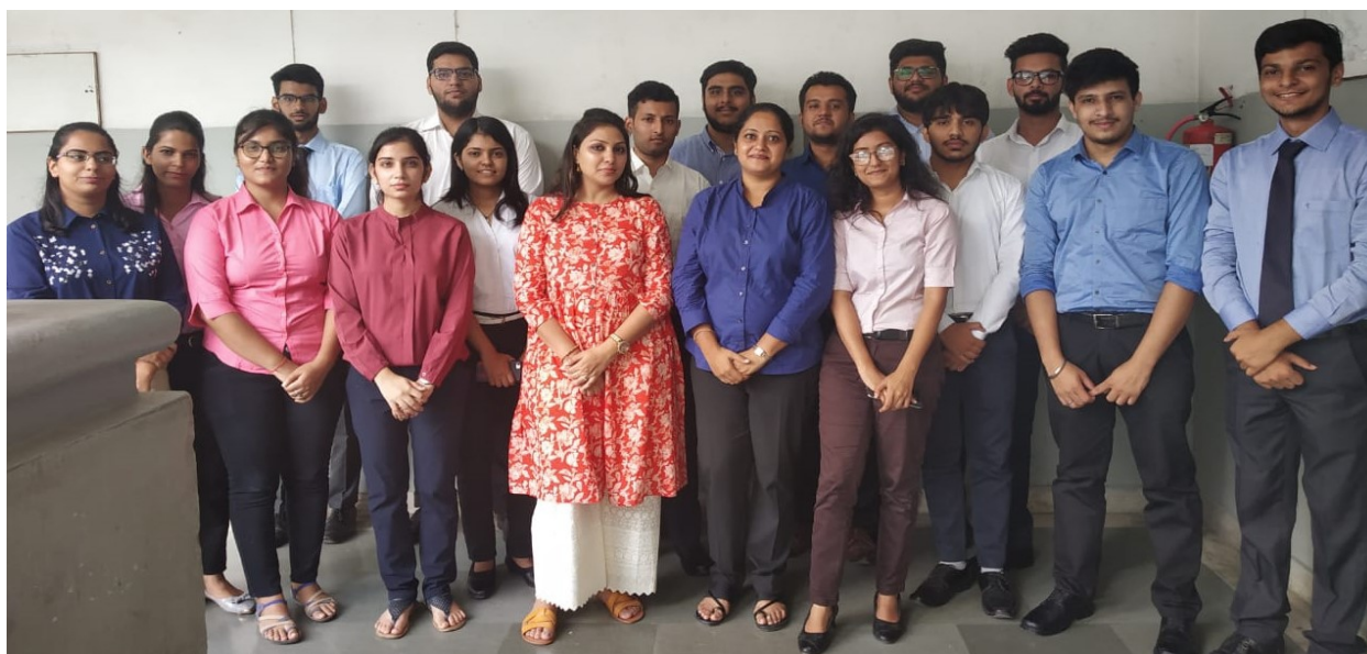
Input Session Indigo