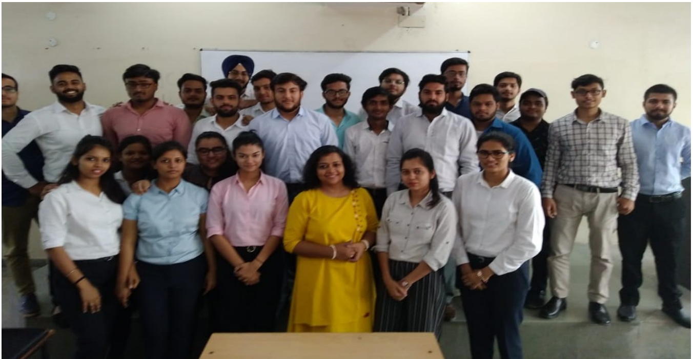
Preparation Session on HP Pool Campus