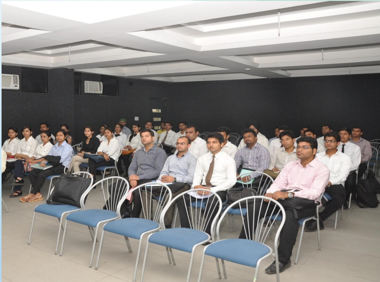
Training for IBM & NIIT