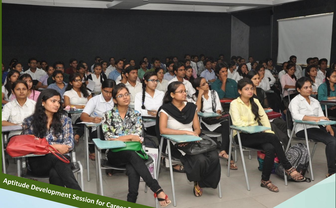
Aptitude Development Session for Career Breakthrough