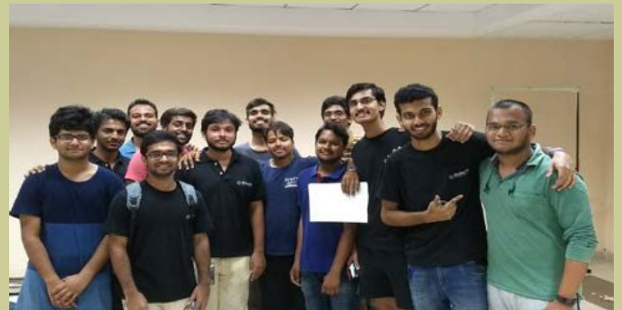
Students of 5th sem ECE participated in Problem Statement Robotics Escalade Techniche 2017 at IIT Guwahati on 4.9.17 and won first prize.