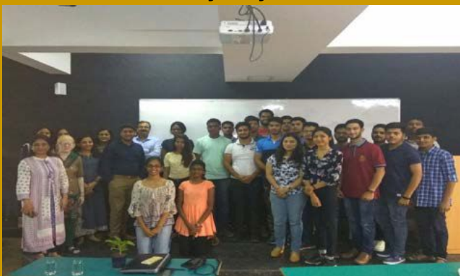
Orientation day 1 st year on 10.7.17