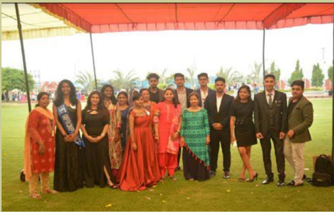
Fresher’s party 1 st year students on 9.8.17.